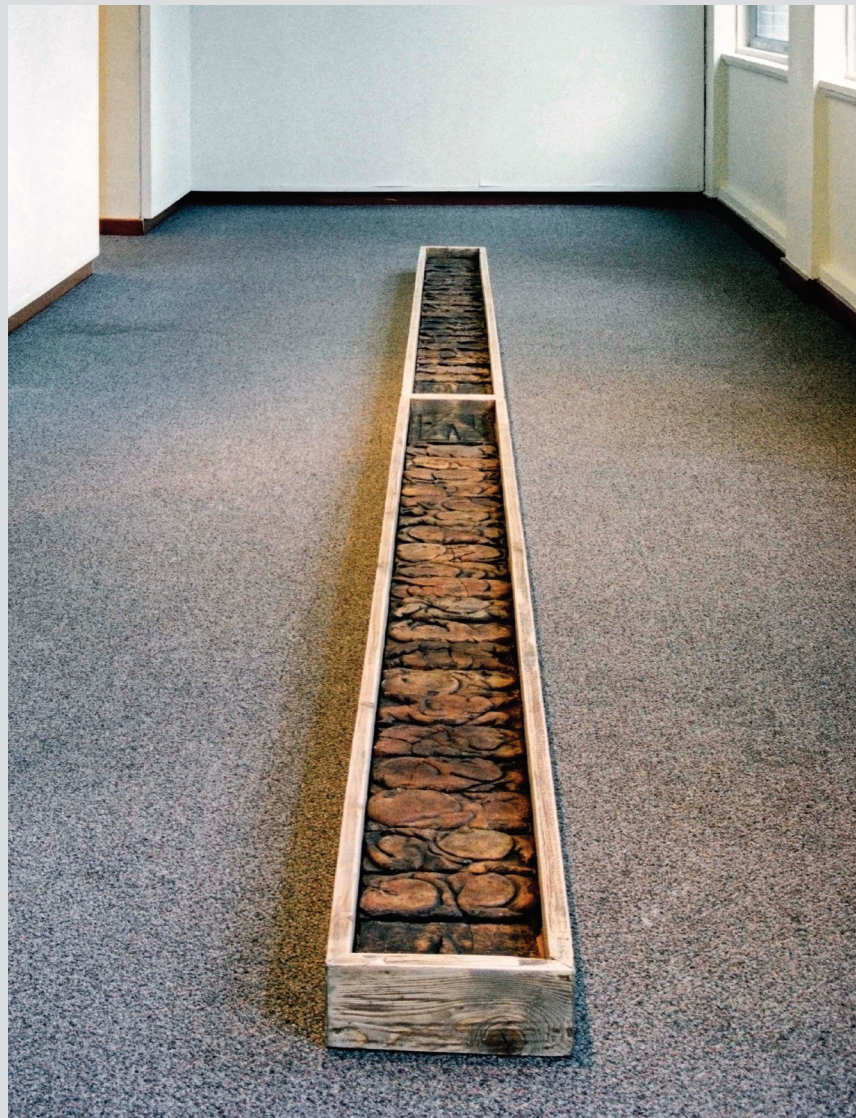
Installation view of TSANG KIN-WAH's aNYbody , 2002, inked stoneware plaque, 528×25.7×11.8 cm with frame, at the Hong Kong Visual Arts Centre, 2002.