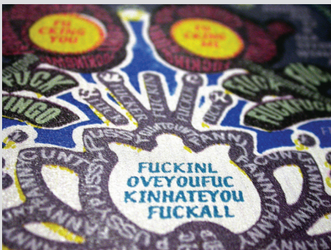
Detailed installation view of TSANG KIN-WAH's Untitled No. 1 , 2003, silkscreen and acrylic on paper, 300×300 cm, at the Hong Kong Museum of Art, Hong Kong, 2003.