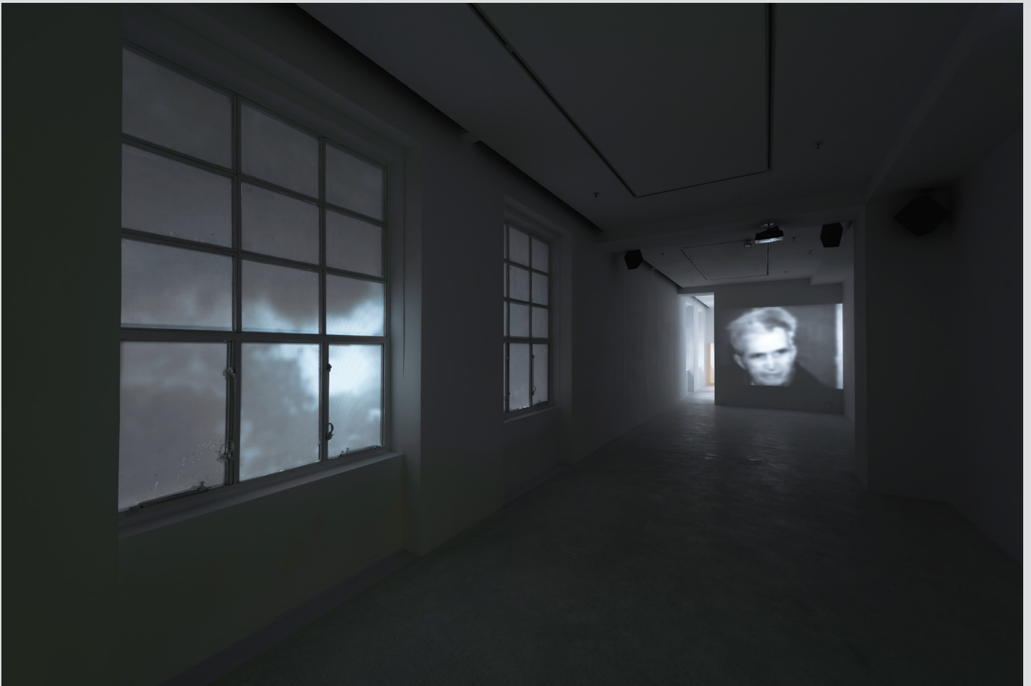
Installation view of TSANG KIN-WAH's Ecce Homo Trilogy I , 2012, multichannel video with sound and text installation, dimensions variable, at Pearl Lam Galleries, Hong Kong, 2012.