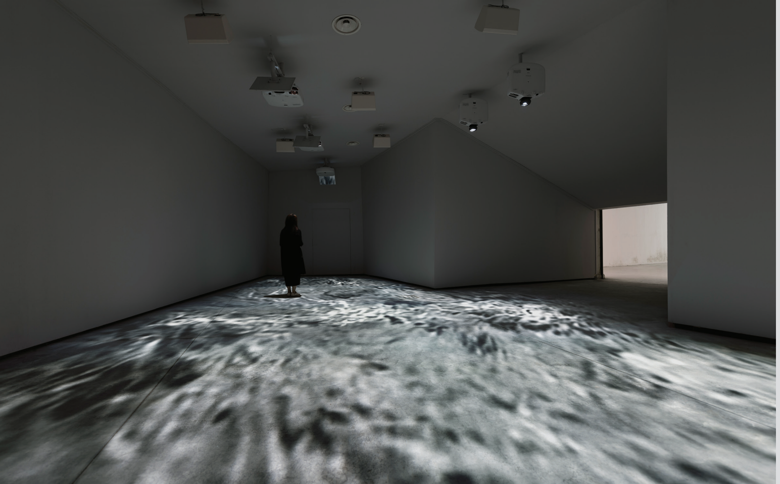
Installation view of TSANG KIN-WAH's The Infinite Nothing , 2015, multichannel video and sound installation, dimension variable, at the Hong Kong Pavilion, 56th Venice Biennale, 2015. Commissioned by M+ Museum, Hong Kong.

Based on Friedrich Nietzsche's idea of eternal recurrence and other references, The Infinite Nothing is a work composed of four parts that form a cycle. It talks about the evolution of different stages in life. There are two rooms and a courtyard in the Hong Kong pavilion. I decided to cover the open courtyard, and to build a structure to create a singular space. The four spaces symbolize four stages, from a state of emptiness and ignorance, to a state of addressing our desire to acquire anything we are taught to acquire, and the need for social bonding. The fourth stage is where people try to overcome themselves to become better. The setup echoes the idea of eternal recurrence, that we constantly have to overcome ourselves, but without being able to reach a final destination in the end.