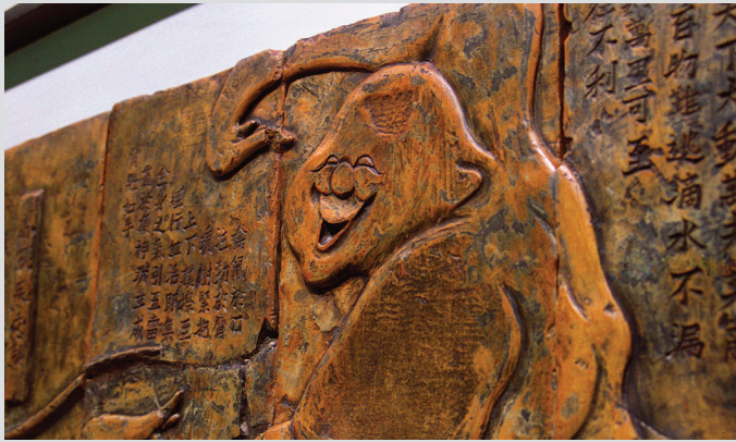
Installation view of TSANG KIN-WAH's Super Magic Kung Fu , 2000, inked stoneware plaque, 553.5×59×6.5 cm with frame, at Art Museum, the Chinese University of Hong Kong, 2000.