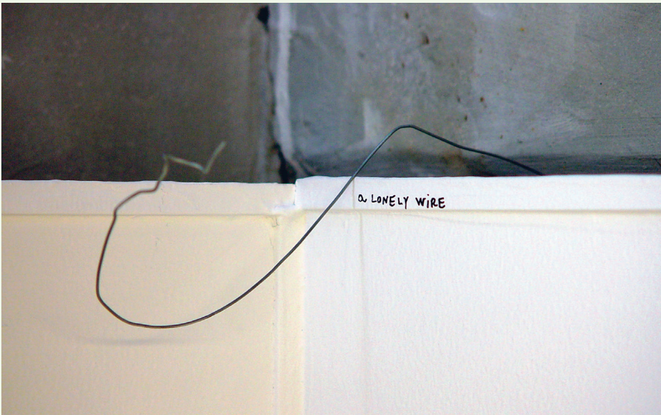
(This page) NEDKO SOLAKOV , A High Level Show with a Catalogue (details), 2002, felt-tip pen on wall and objects; a catalogue with close-ups of stories displayed at a height of 4.5m, dimensions variable. Installation view at Center for Contemporary Art Kitakyushu, 2002–03. Courtesy the artist and CCA Kitakyushu.

IB: It seems that you often put yourself in the “shoes” of your viewer. How would you imagine your audience to behave in experiencing such narrative installations? I love A High Level Show with a Catalogue (2002), where you pressed the visitors of your exhibition at the Centre for Contemporary Art Kitakyushu in Japan to refer to the show’s catalog while in search for your hard-to-see doodles high up on the museum’s walls. Do people read and search in your other installations as well?